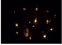
The candle-lit Feraferia Henge at night